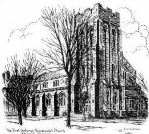
Liberate Truth ~ Radiate Kindness Love Courageously