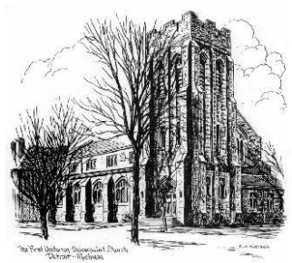
Liberate Truth ~ Radiate Kindness Love Courageously