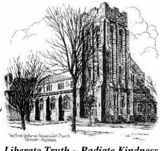
Liberate Truth ~ Radiate Kindness Love Courageously